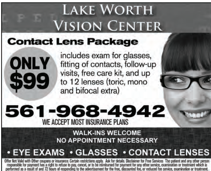
MEDICAL AND HEALTH BASED BUSINESSES