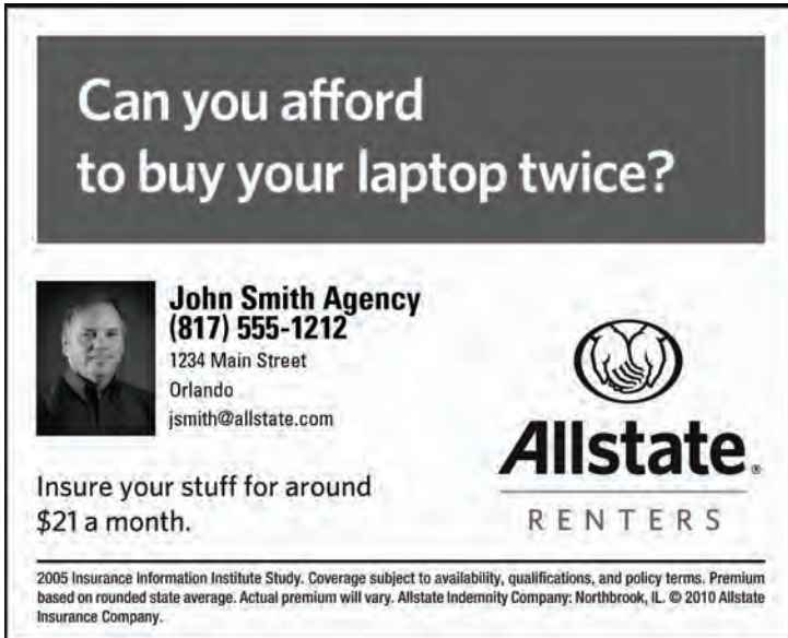
INSURANCE BASED BUSINESSES

Below are samples of several types of local businesses that benefit from advertising in Resident News. Any small or local business in any category, seen here or not, would benefit from this low-cost advertising option.