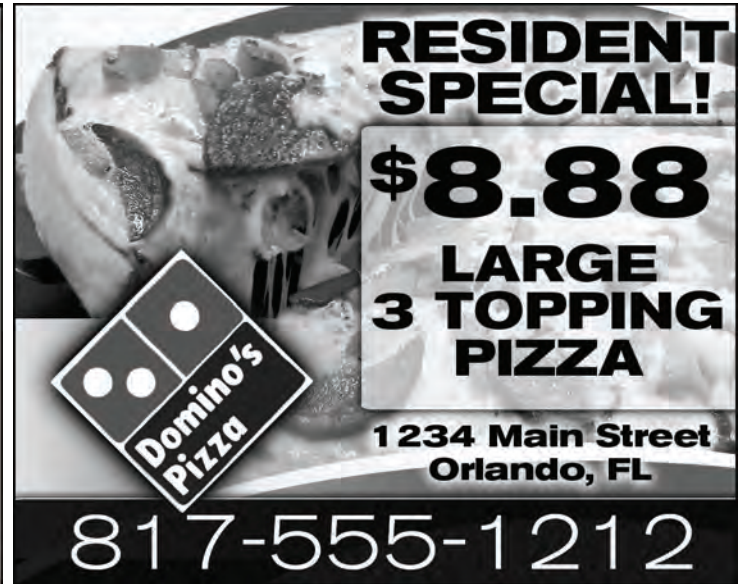
RESTAURANT & DELIVERY BASED BUSINESSES