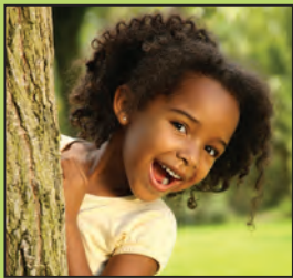
RESIDENTS WITH KIDS